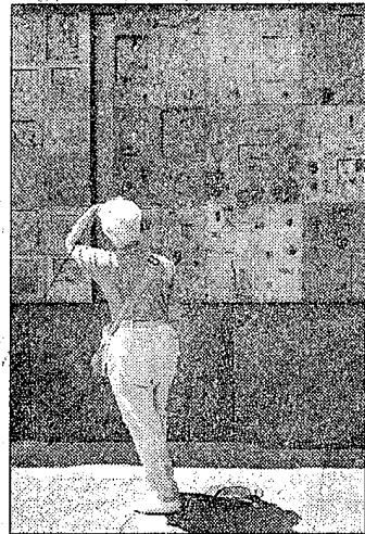
A visitor studies the bronze sculpture, which has been mounted at a height that puts some Braille characters out of reach.